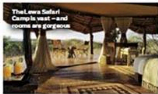
The Lewa Safari Camp is vast – and rooms are gorgeous.

It's a short flight from one tiny private bush airstrip to our next one at the Lewa Wildlife Conservancy. From there we're driven to the Lewa Safari Camp, which boasts the most spectacular wildlife viewing a cross 65,000 acres of protected wilderness.