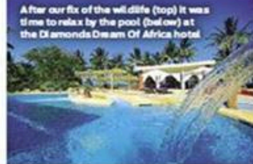
After our fix of the wildlife (top) it was time to relax by the pool (below) at the Diamonds Dream Of Africa hotel.

Activities to keep us amused back on dry land included beach yoga, water aerobics and pampering sessions at the hotel's Mvuus spa, which has several thalassotherapy pools. One evening, the hotel set up a candlelit dinner on the beach, where we enjoyed a sublime seafood feast to the backdrop of gently lapping waves. A perfect way to end our truly memorable African adventure.