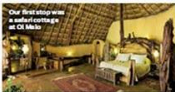
Our first stop was a safari cottage at Ol Malo.

On arrival, we were shown to one of four cottages – made from local stone, olive wood and topped with a thatched roof – in the grounds, which had a lovely veranda offering views over the plains. We soaked up more views over lunch